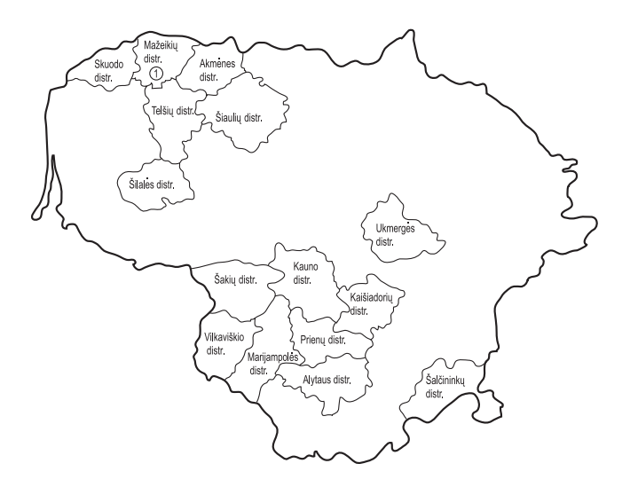
FIGURE 1. Map of milk samples collection.

Sampling. Raw milk was collected in winter (March and April) and grazing (June and July) seasons of 2005 at two milk factories in Lithuania (Figure 1). Samples of collecting milk originated from five industrialised districts (fuel factory in Mazeikiai district, cement works – in Akmene district and